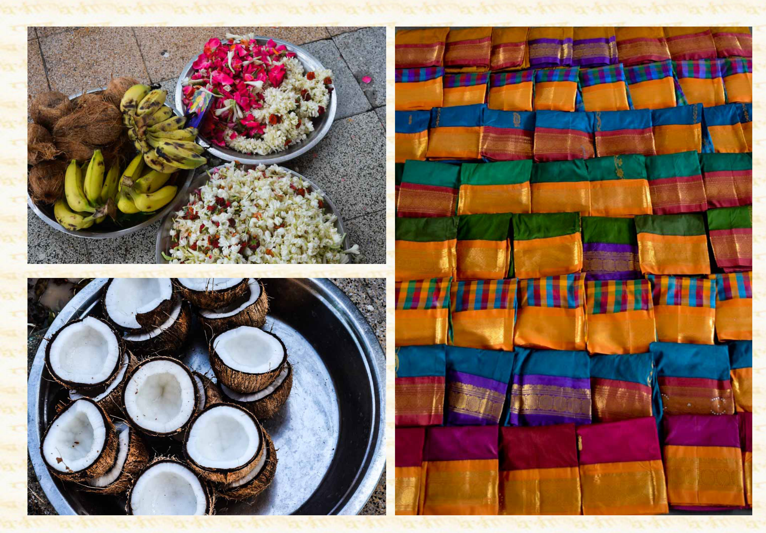
Eight brand new silk saris are required for each day of the ritual, plus lots of fresh flowers, fruit, and coconuts.