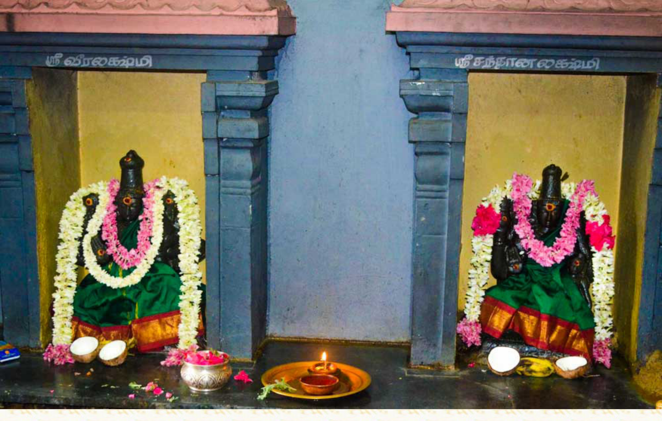
At the conclusion of the abishekam, each of the Lakshmi murtis is dressed and decorated nicely. Then offerings of fruit and coconuts are made, concluding with the offering of light (called aarti).