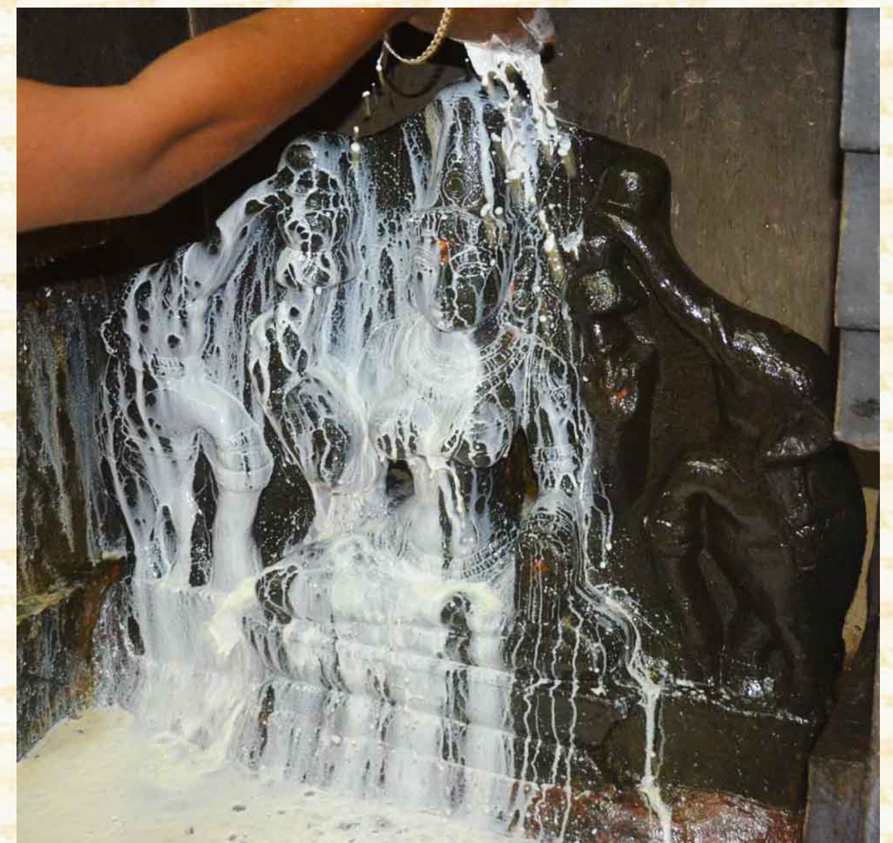
It takes many litres of milk to perform an abishekam!