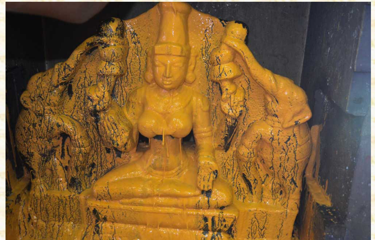
The Eight Forms of Lakshmi (Ashtalakshmi)

Gaja Lakshmi - Giver of animal wealth like cattle and elephants (gaja)